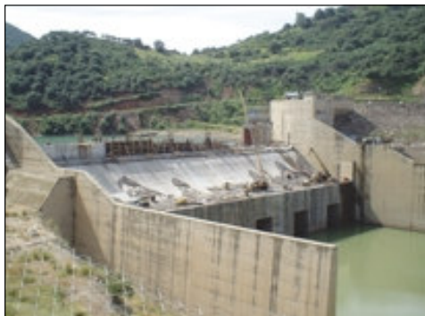
The Beni Amrane uprating project under construction.

Fortunately, the major earthquake of 21 May 2003, did not claim any casualties at the dam site. The Hydroplus installation held up satisfactorily under the