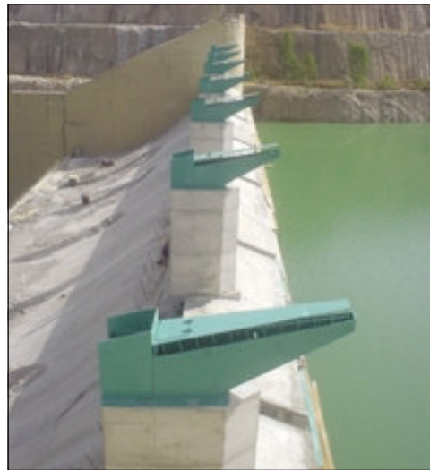
The fusegates at Beni Amrane.

Located 50 km east of Algiers, near the town of Thenia, the 39.5 m-high Beni Amrane dam provides drinking water for the capital. Commissioned in 1988, this gravity dam quickly began to suffer from a significant level of silting, which reduced its storage capacity from 11.6 \times 10^6 \text{ m}^3 to 5 \times 10^6 \text{ m}^3 at the beginning